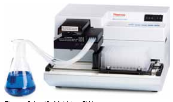
Thermo Scientific Multidrop DW