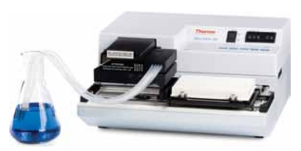
Thermo Scientific Multidrop 384