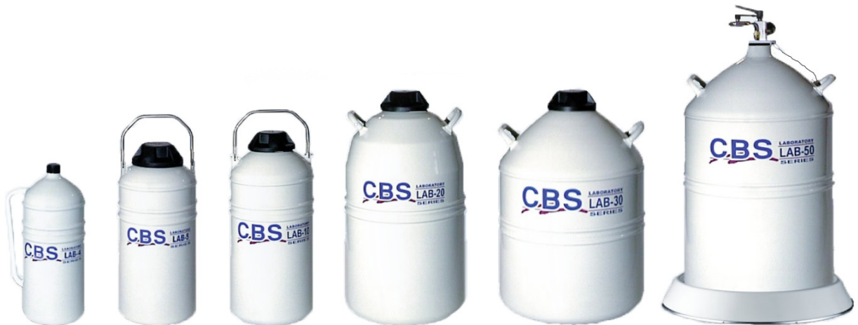
Lab 50 Shown with Optional Roller Base & Withdrawal Device

The LAB Series dewars use high efficiency super-insulation and aluminum construction to make them lightweight and the most efficient containers available. Their shape and handles make them easy to lift and pour. The LAB Series dewars can also be fitted with pouring spouts, withdrawal devices, or dippers to aid in liquid nitrogen transfer.