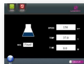
Touch Screen Panel