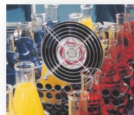
Forced Air Convection