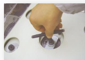
1-50mm Shaking Diameter Adjustment