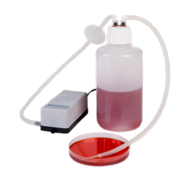
Incl. quick lock connection, 1x 3m hose with HEPA filter