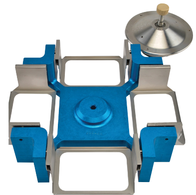
Savant PRO-10 Rotor Kit