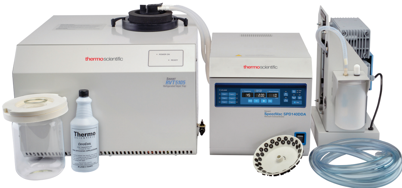
SpeedVac SPD140P1 Vacuum Concentrator Kit