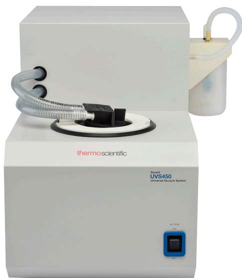
Savant UVS450 Universal Vacuum System