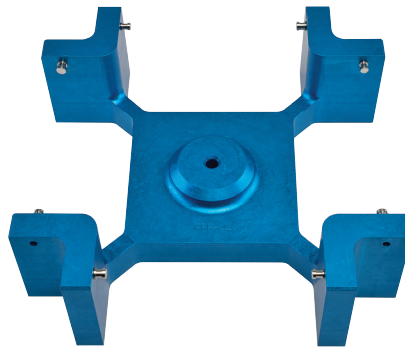
Savant FPR-4A Universal Plate