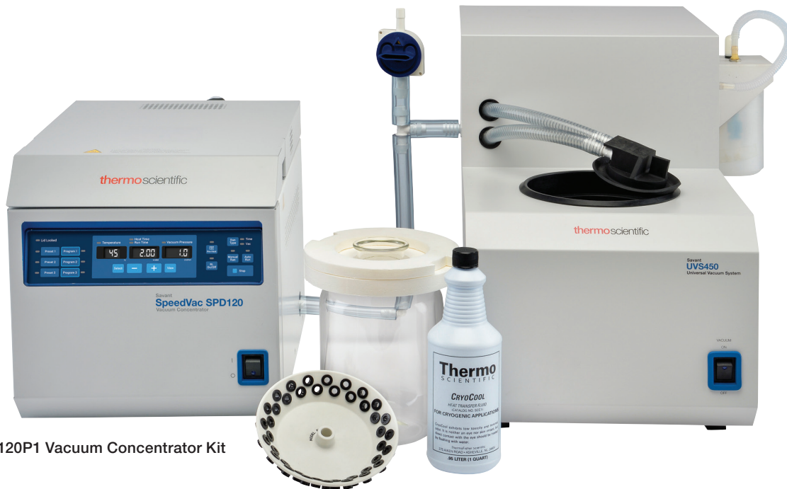
SpeedVac SPD120P1 Vacuum Concentrator Kit