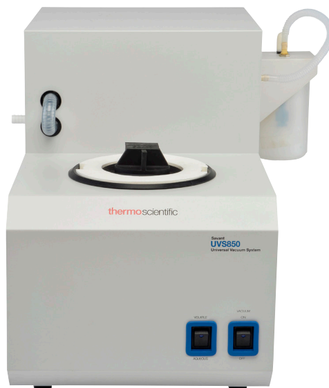
Savant UVS850DDA Universal Vacuum System