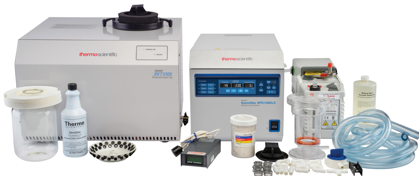
SpeedVac SPD130P1 Vacuum Concentrator Kit