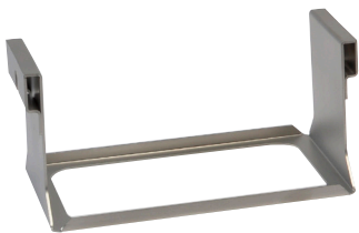
Savant UPC-1 Carrier