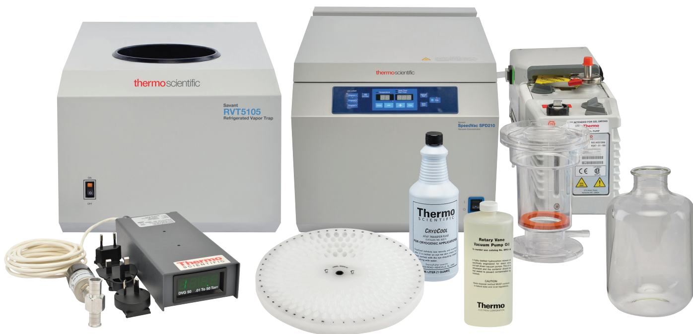
SpeedVac SPD210P1 Vacuum Concentrator Kit