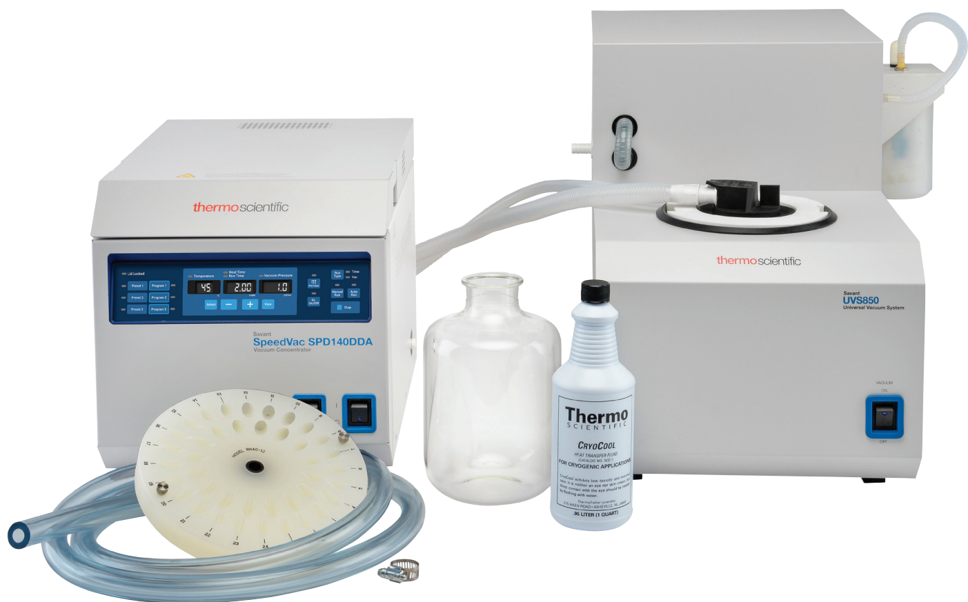
SpeedVac SPD140P2 Vacuum Concentrator Kit