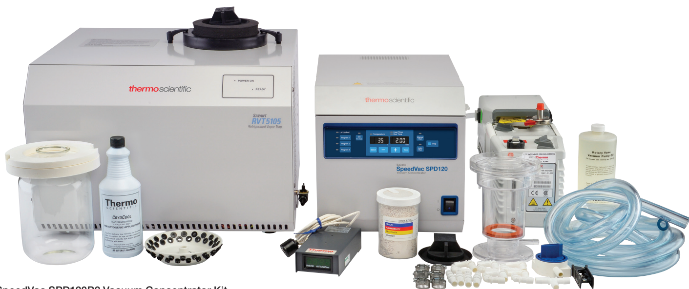
SpeedVac SPD120P2 Vacuum Concentrator Kit